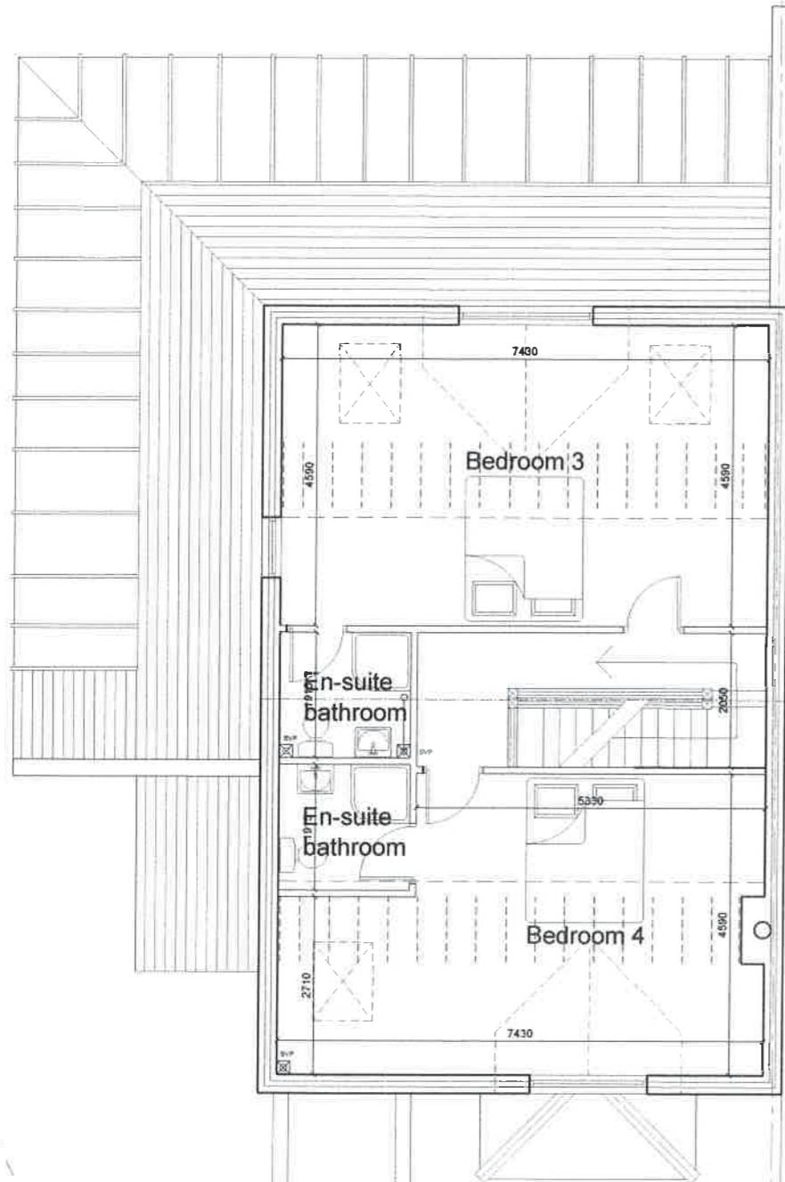
Second Floor Plan Proposed